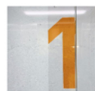
ECT Programme Year 1 ECTP

Your ECT programme materials can be found here: